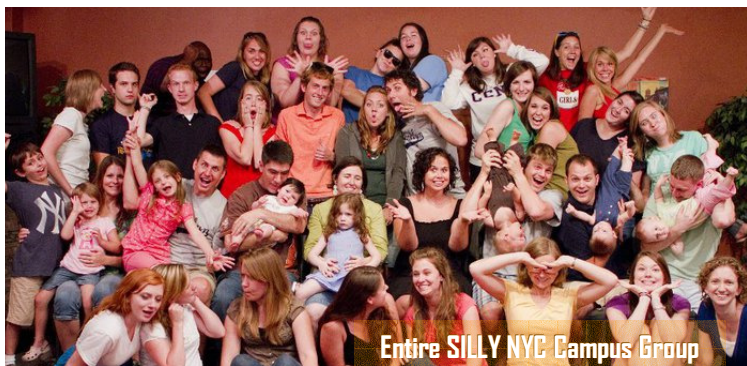
Entire Silly NYC Campus Group